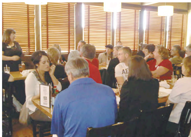
The March 16 Noon Niche Networking at Jim 'N Nick's Bar-B-Q was a whopping success, with more than 35 Chamber members attending the lunchtime event.

The Chamber's Noon Niche Networking has become a popular way for some members to network. The March 16 Noon Niche Networking at Jim 'N Nick's Bar-B-Q (photo at left) served a sold-out crowd.