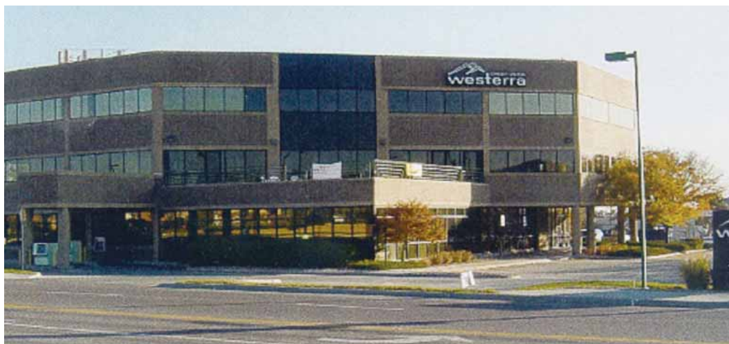
Westerra Federal Credit Union in Aurora

The Aurora Chamber of Commerce is relocating.