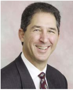
Mark Moses Chair