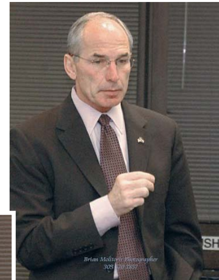
Breakfast Talk — Colorado Congressman Bob Beauprez and State Representative Morgan Carroll (L) were among the many speakers who addressed the second Legislator's Breakfast of 2006. More than sixty Chamber members attended the event hosted by Sylvia Young and her staff at The Medical Center of Aurora.

The Medical Center of Aurora hosted the second Legislator's Breakfast recently. More than 60 people breakfasted on TMCA's South Campus and got updates from Eastern Metro state legislators and U.S. Congressman Bob Beauprez. In addition, the Government Affairs/Education Committee and Transportation Committee distributed the latest legislative policy White Papers that clearly define The Chamber's position on key issues including Economic Development, Healthcare Costs & Insurance, K-12 Education, Higher Education, Initiatives and Transportation. Copies of the one-page policy papers are available at The Chamber.