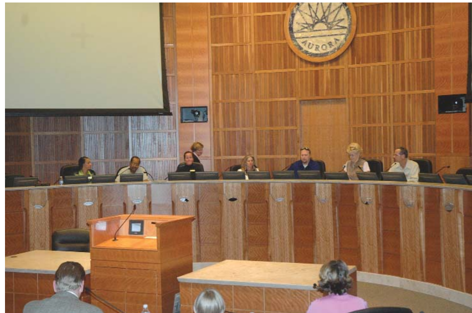
The Big Decision — Leadership Aurora class members ponder their decision about allowing the construction of the Y-Ice project during their mock city council meeting.

A finely tuned process involving city officials, staff, and citizens operates in full swing on a daily basis to ensure that new development proposals are analyzed, critiqued, and in compliance with city growth objectives. The role playing exercise was an ideal way to become immersed in the new development proposal process and more educated about the overall affects new development has on the city's economy and infrastructure."