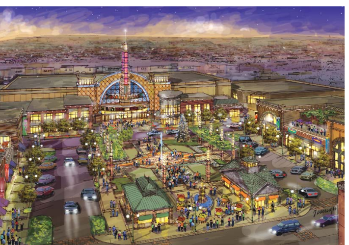
Southlands Life Style Center has gone from artist's concept to reality in

Southlands is home to more than 40 retailers and restaurants, a United States post office, and a 16-plex