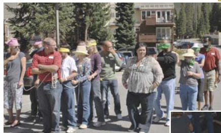
Class members participate in teambuilding exercises