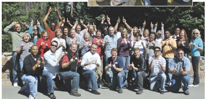
Aurora Leadership Class of 2010-11