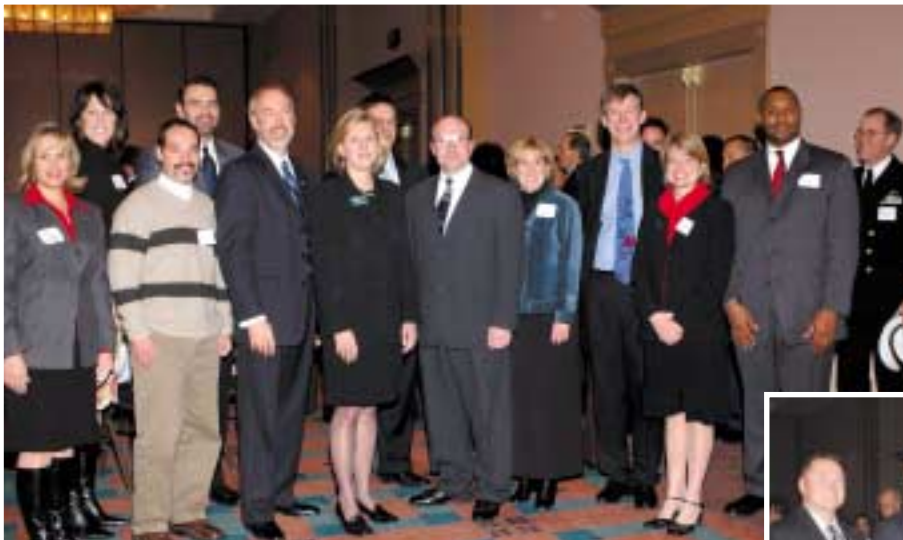
Representatives of Waste Management, a title sponsor of the Mile High Regional Partnership Luncheon, stand with the mayors of Centennial, Greenwood Village, Aurora and Denver on December 11.