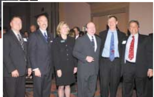
Mayor Pye (2nd from left), Mayor Sharpe, Mayor Tauer, and Mayor Hickenlooper stand with representatives of Comcast, a title sponsor of the Mile High Regional Partnership Luncheon, on December 11.