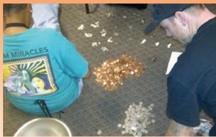
A heartfelt donation to Comitis Crisis Center — Students at the Florida Pitt Waller Elementary School wrote encouraging cards for homeless youth and also donated a large bag of change being counted by Comitis staff.