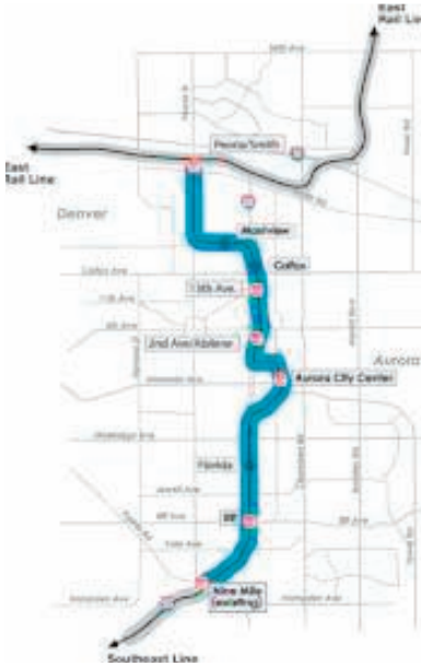
FasTracks I-225 Rail Line

Aurora is also one of the fastest growing oil and gas producing locations in the country. The oil and gas industry brings many benefits to our state, including providing essential resources, a boom in local jobs, and significant tax revenues that have helped Colorado ride out the recent economic downturn and avoid greater cuts to essential services. Aurora is also a regional leader for business-friendly attitude and a broad