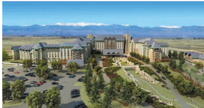
Artist concept of the Gaylord Hotel in Aurora

Aurora and its partners in the region have something for everyone, with opportunities for business in every industry. ■