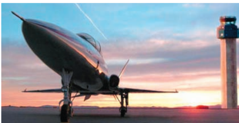
Front Range Airport

Front Range Airport was designated as one of the first Space Ports in the country and the only one in Colorado. The research and development at Front Range will elevate and transport Colorado into new opportunities and