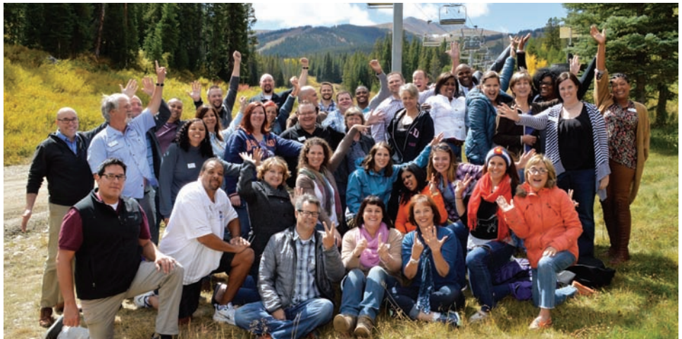
2015/2016 Leadership Aurora Class in Breckenridge.

The first night's reception started with a "Claim to Fame" game, allowing class members to learn more about each other as they guessed who each "Fame" belonged to. Little did we know that we have such a diverse and "famous" class! We ended the evening in a bit of frenzy as there was a cable outage in the area, and the Broncos game was on. We experienced our first challenge as a class, pulled it together, and managed to hike downtown to find Breckenridge Brewery where we watched the Broncos barely make their victory!