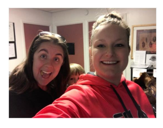
CUTE PIC LADIES!