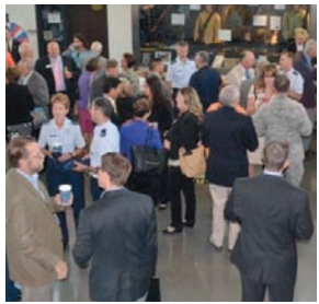
More than 125 people from the ADC and MAC attended the joint meeting, along with local/state elected officials, business and community leaders, and U.S. Congressional representatives.