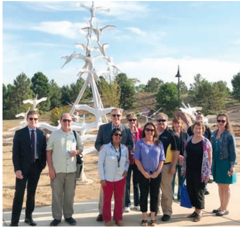
Representative of the Business for the Arts committee tour the 7/20 Memorial, located at East Alameda Parkway and Chamber Road in Aurora, CO.

The 7/20 Memorial was created as a space where the community and those impacted by the tragedy of July 20, 2012, can go to reflect and remember loved ones, gather strength, and feel peace or hope.