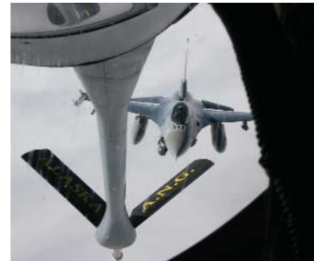
Class members watch a midair refueling of an F-16.

After a light and delicious lunch we felt the need for speed. We would soon be air-borne for the most experiential and exciting component of the day that being a sortie in a KC-135 airplane providing a training mission for our learning that allowed us to be there and watch the elegant midair ballet of an F-16 refueling procedure. We were enthusiastic and maybe a little anxious as we all donned our oxygen bags, strapped into the red canvas harnesses, and roared from the runway. We experienced another memory moment as we watched the precision flying of the pilots and crew from the vantage point of lying on our bellies, in the rear of the plane, next to the boom officer who guided the 40 foot long fuel line to the fighter jet below.