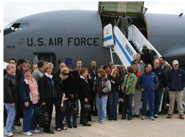
Leadership Aurora class prepares to board a KC-135 airplane at Buckley AFB.

We discovered that our own Barbara Atwell would be the expert tour guide for our Windshield Tour and site visits of the Buckley Chapel, Dormitories, and Health Complex. The Chapel works hard to serve service men and women from all faiths. The Dormitories were newly built and featured a very cool perk that class member Daryl Guill was principal in coordinating — a state of the art mini-movie theater with comfy seats and rich surround sound. The Health Complex was truly state of the art, as well, and included updated weights