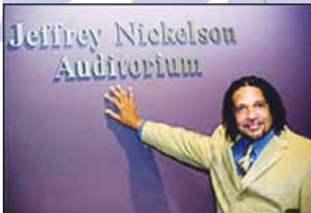
Shadow Theatre Business for the Arts