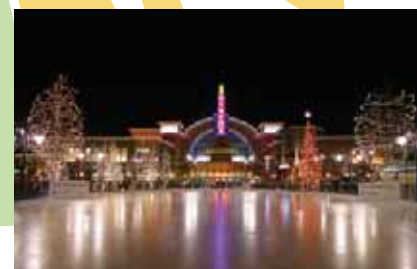
Southlands Business of the Year