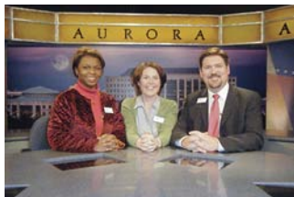
Media Day Session