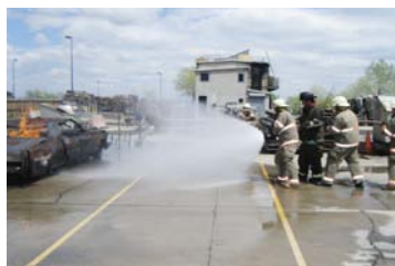
Fire Day Session