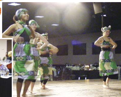
Mudra Dance Studio performers