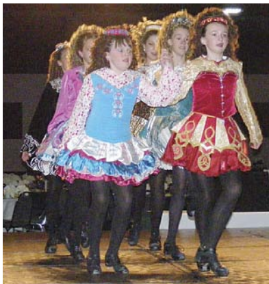
Reed School of Irish Dance performers