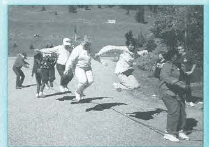
All together now – 1-2-3 Jump!