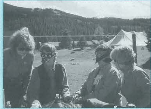
Being blindfolded proved puzzling.

Ice breaking, team building, Milky Ways and Snickers, Sir Squirrel’s escapades, and discussions followed an evening of candle lighting and wood burning. Whether we were dining in the dark or blindfolded in the sun, we could clearly see that this was going to be a memorable year. Relationships were built and bonds were formed in those three days. We went up the mountain as 35 strangers and came down one cohesive unit. We were ready and willing to face the unknown ahead, trusting in each other.