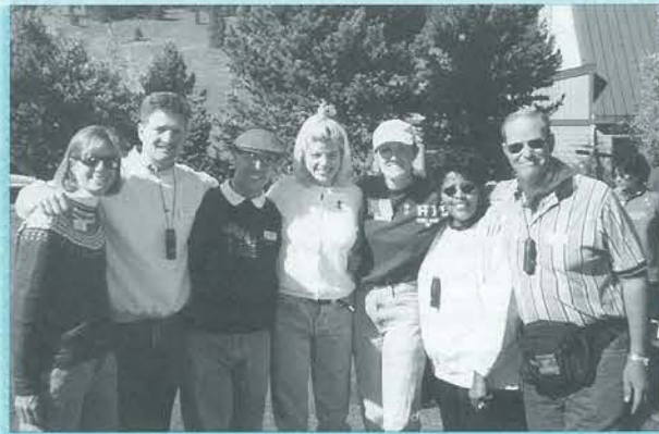
New friendships were formed.