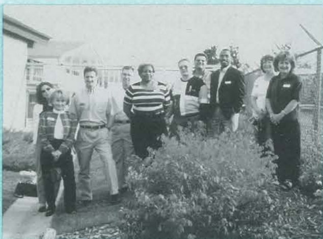
Exploring the community's needs.