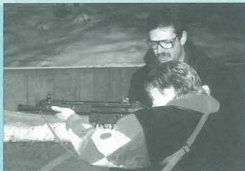
Sub-machine guns can be quite a kick.