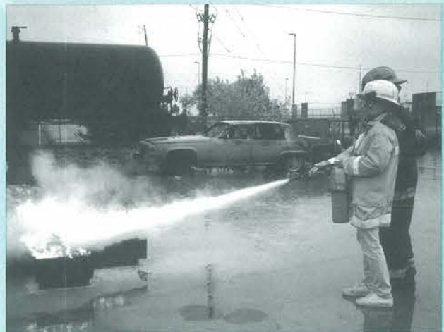
Learning to extinguish a fire at its base.

Once upon a time, on a cold and rainy night . . . oops, it was daytime! We learned what Aurora Firefighters deal with every day by watching a surprising demonstration about the triangle of fire -- fuel, heat and oxygen. An afternoon of fun on the academy drill ground (in the rain, of course), included learning to fight a fire at the base where the solid becomes a vapor, wearing firefighters’ bunker gear, putting out a propane tank fire with a fire hose that took four people to hold, and exploring a fire safety mobile trailer. It made us all feel a lot safer realizing the knowledge, expertise and training it takes to become a firefighter.