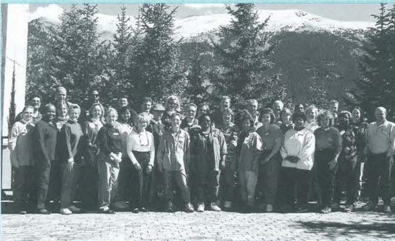
2000-2001 Leadership Aurora class at beautiful Copper Mountain.