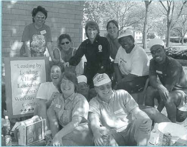
Class members take a well-deserved break.