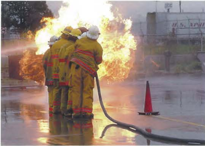
Some of Leadership Aurora's fledgling firefighters douse flames at the Rocky Mountain Fire Academy.