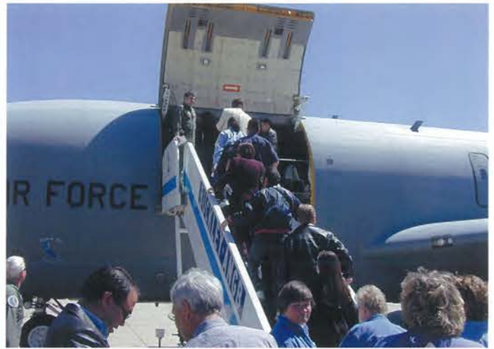
Due to mesh jumpseats and no cocktail service, this C-135 Stratotanker was grounded.

Class members had a chance to get up close and personal with Aurora's giant golf balls. With heightened security this year, there were no top-secret satellite tours. But we did venture inside Hanger 801 to watch maintenance work on an F-16, navigate a flight-simulated fighter and see life through a night-vision viewer. Some of us boarded a refueling plane and soared over the eastern Colorado plains to catch glimpses of military aircraft hooking up for a drink. The others stayed grounded due to maintenance issues, witnessing instead a military fly by before drowning those missed-opportunity sorrows at the Camana Club. For both groups, the day increased an understanding of and respect for the military and its critical importance in maintaining the safety and integrity of the nation.