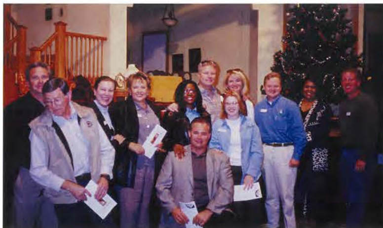
Leadership class members visit the Aurora Fox Arts Center during their first monthly session, Community Day, when they gained an enhanced awareness of our communities' needs.

The Leadership class offered a Senior Internet Training Course for seniors at the Aurora Senior Center, which demonstrated how to use the AT&T Broadband Internet Service available at the Senior Center and helped to bridge the digital divide in Aurora.