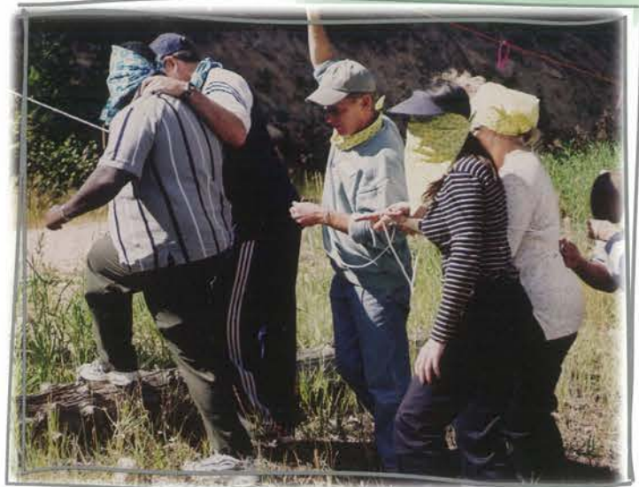
The blind leading the mute through a unique obstacle course.

The stuff people will remember most from the retreat were things such as the shouting at the volleyball court, the blind leading the blind, the infamous "Hot Seat", the late night party, trying to determine who in the group used to live in a hippie commune, and so many other experiences. However, one thing that everyone went through on a very real and personal level was the "leadership breakthrough" that we all had. If you want proof, just attend our graduation and see for yourself all the amazing things this powerful group of leaders will have accomplished over the course of the next year.