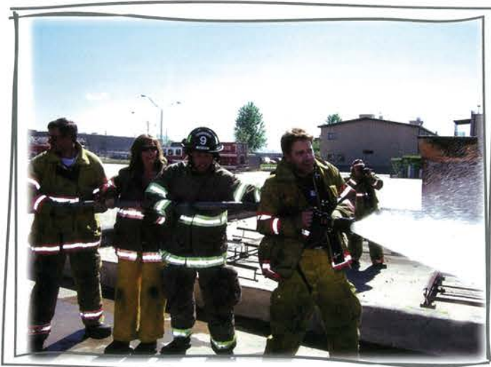
Putting out fires is fun!

Many of us overcame our fears of height or claustrophobia to take advantage of this unique opportunity. As the class felt the heat of live fire and sweltered in our gear, we were charmed and humbled by the kindness, dedication, knowledge and skills of these men and women fire fighters who save lives, property and even pets on a daily basis. As our final formal Leadership session, it will burn in our memories as educational, physically challenging and fun!