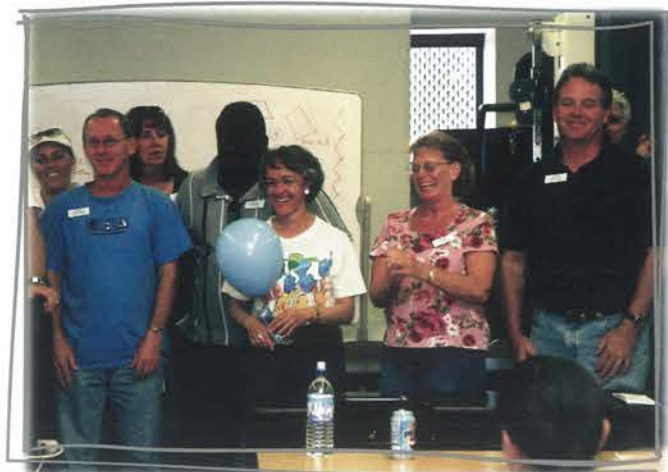
The Social Committee celebrated classmembers' birthdays each month by presenting balloons and their own rendition of "Happy Birthday to you."