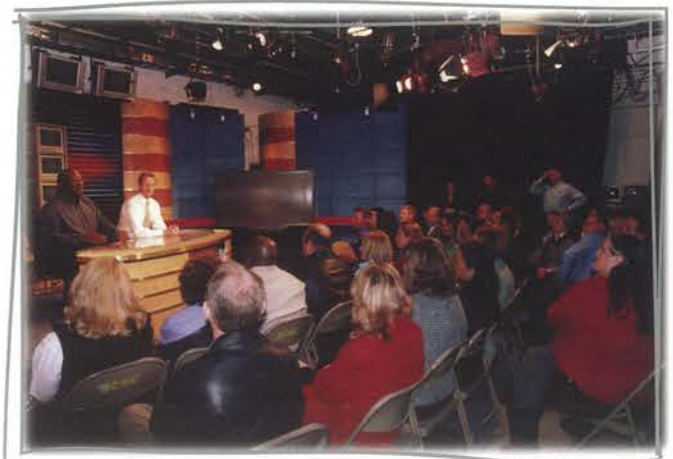
Channel 4 says: "We'll tell you what's news!"

the class was our chance to run the studio, operate the news floor and the cameras, and take the place of the mayor, city officials and citizens discussing the city budget. We had a great time watching our class-mates respond to the Aurora 8 reporters and delighting in the ingenious use of the information we have learned about Aurora in our previous sessions. The Media Session gave the class a better appreciation of how the news is reported and we will be better prepared to understand and interpret what we see and hear in the news media.