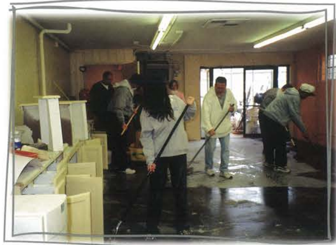
Mopping up ten years of accumulated clay dust.