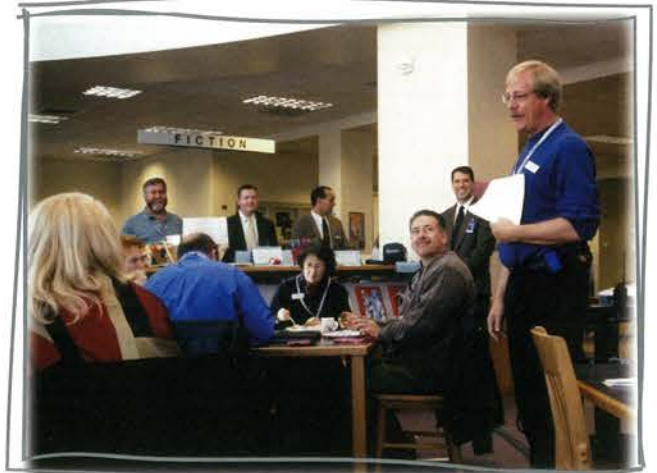
Leaders learning about "School Daze" in Aurora.

Aurora. The class broke into groups and visited other schools in the Aurora Public School system. We learned about the many challenges facing the school system and also met extremely committed individuals within the districts. Finally we returned to the Community College and ended with a discussion on federal, state, and local guidelines in the school system.