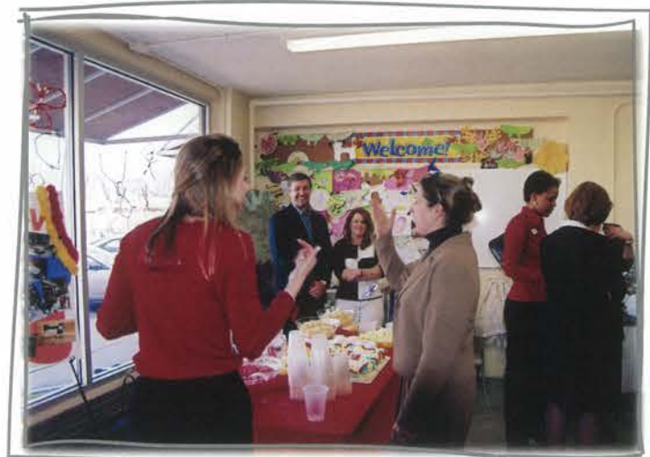
Spirits were high during the Grand Opening of the "new" DAVA Studio.

The Leadership Aurora class decided to do one major project, but also several smaller ones to benefit the community. The class donated Halloween candy and gifts for the kids at Colfax Community Network in October. Many of the class members were involved in putting together Thanksgiving baskets in which over $14,000 was donated for the project. They also helped in assembling food and gifts for over 1,200 Aurora families. In addition, the class collected toiletries for Aurora citizens in Care Centers.