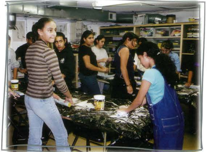
Students getting hands on creative experience at DAVA

Today we were able to see some of the problems facing Aurora, and most importantly we learned about the wonderful people that are dedicated to solving those problems and helping people that are in need.