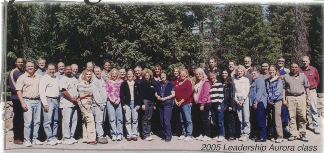
2005 Leadership Aurora class

"Building tomorrow's leaders through trust and communication."