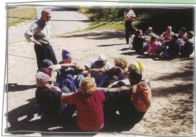
All together now!