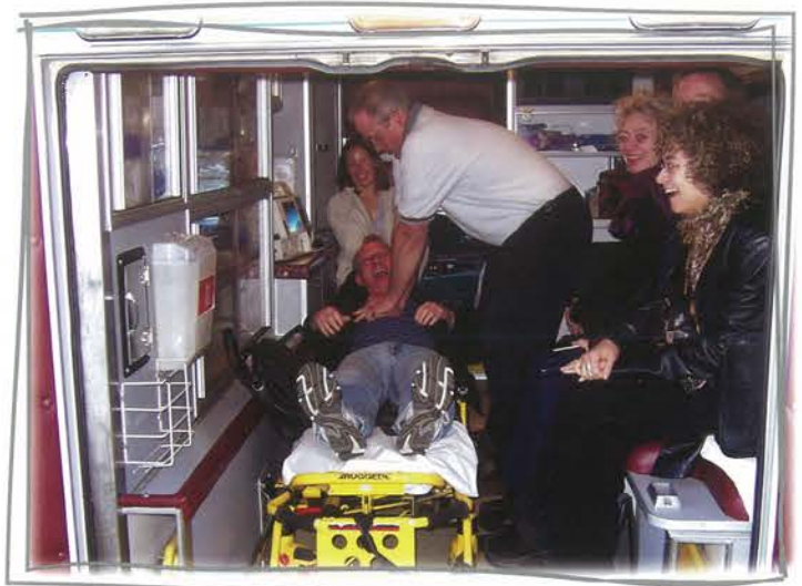
Staying alive with a little help from my friends!