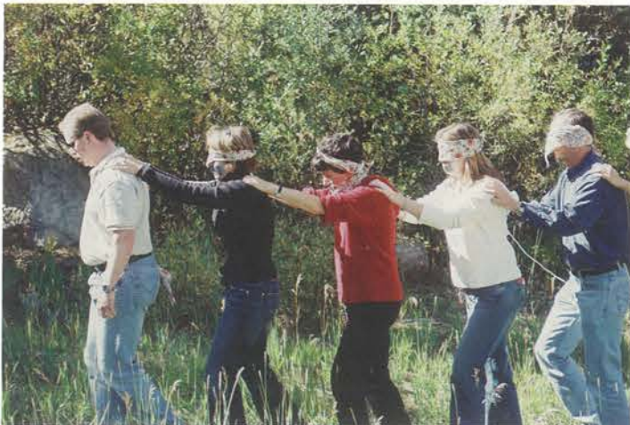
Learning to trust our classmates

The goals of the retreat were to help all class members to connect with one another and come together as a team, to discover and overcome what is limiting us from becoming our very best, and to learn the knowledge, skills and abilities of being an outstanding leader.