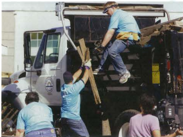
Coal Creek School