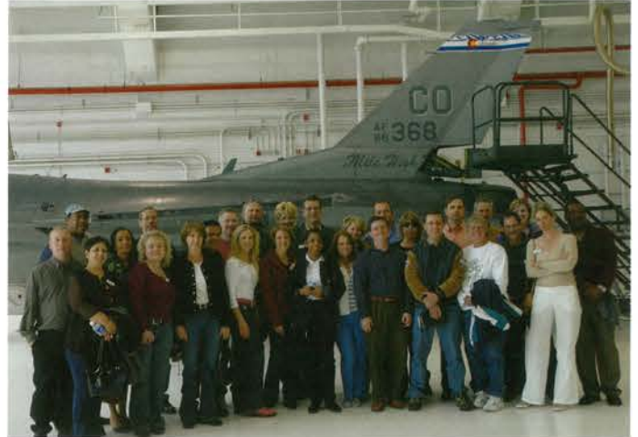
One of these lucky classmates will win this F-16. NOT!

We learned that Buckley AFB has the best tracking technology available to deter acts of terrorism. While we're sleeping, highly trained personnel are deployed from the base at night to many dangerous parts of the world, making countless sacrifices on our behalf. Visiting Buckley reminded us to appreciate what we have...homes, jobs, families, and a sense of security. So, whenever you hear the roar of a fighter jet overhead...during the day or in the middle of the night...it's not just noise...it's the sound of freedom!