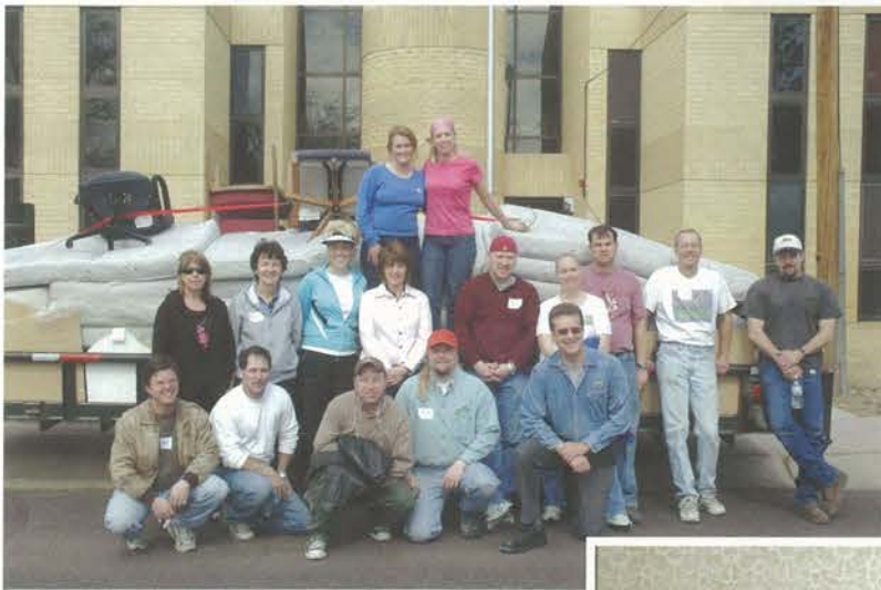
Class members help with spring cleaning at Comitis Crisis Center.

Karl Mecklenburg's football career inspired us to greatness, even though he stands head and shoulders above the class.