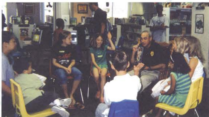
Aurora Public Library