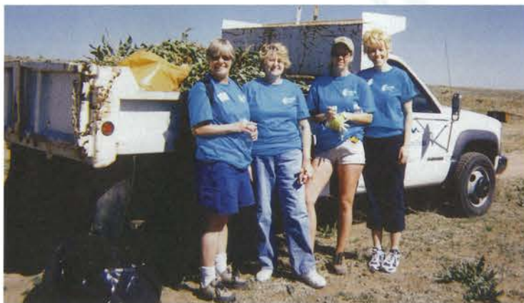
Cherry Creek State Park Cleanup