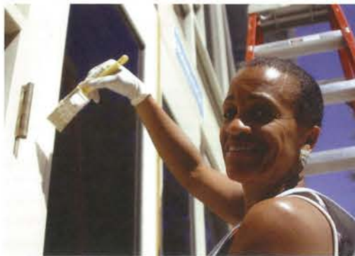
Self Improvement Opportunities

May 13, 2006 was an absolutely outstanding example of what can be accomplished when 160 community leaders, volunteers and business people work together for the betterment of "our" community.