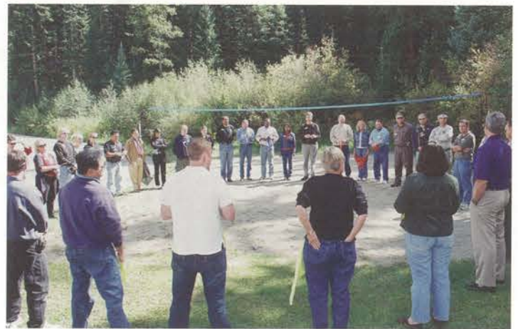
Building a framework for leadership

In September, the 2005-06 Leadership Aurora class began exploring their leadership experience with a two-day opening retreat at the Iron Horse Resort in Winter Park. As the weekend began, thirty-four strangers began a journey seated around a large table at a resort in the mountains. We were told what Leadership Aurora was all about by several Board members, but it was not enough to prepare us for what were about to experience. After the introductions were completed by our new classmates we took a journey down memory lane by sharing a leadership experience from our past.