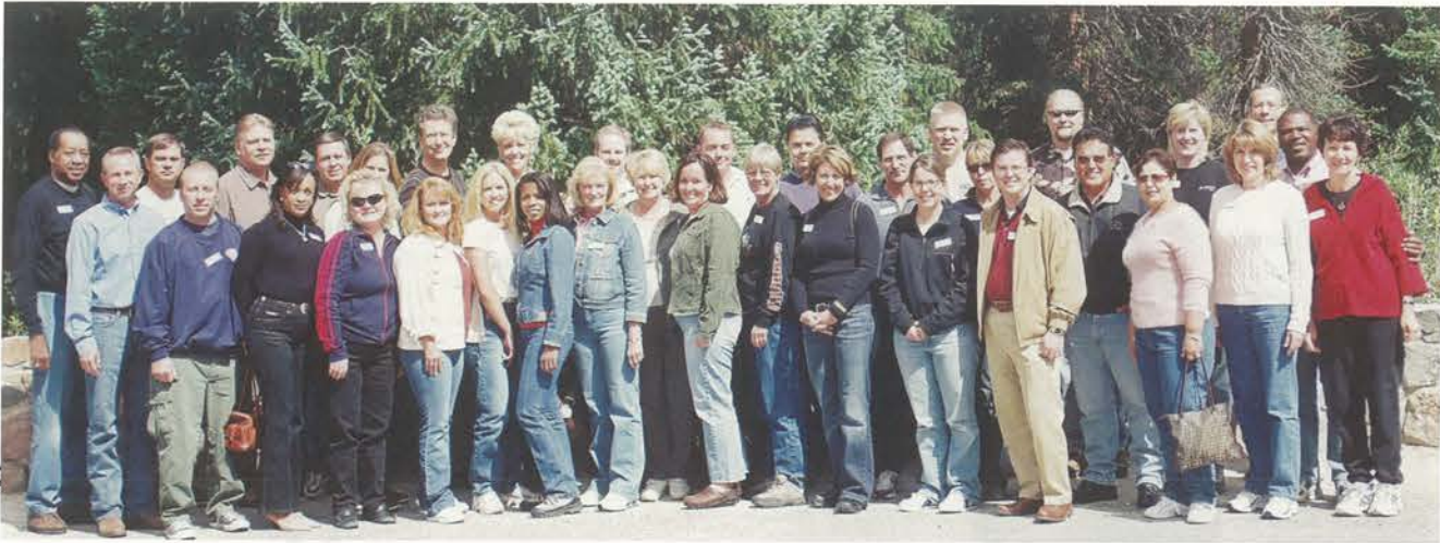
Leadership Aurora Class of 2006