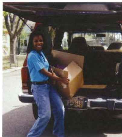
Gateway Battered Women's Shelter