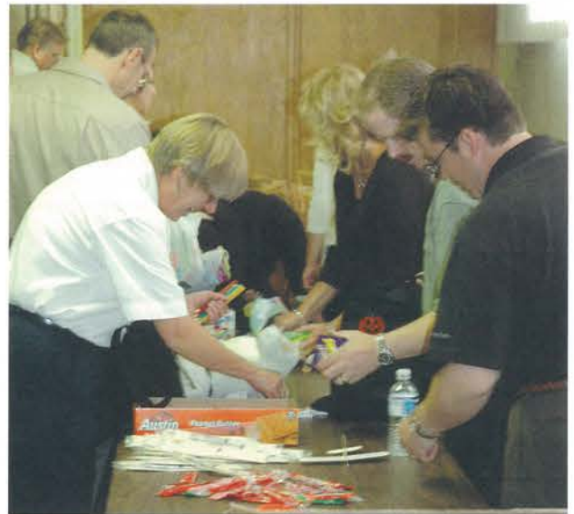
Trying not to eat the candy while assembling Halloween bags for Colfax Community Network kids.

Ignorance may be Bliss, but knowing you helped one person in need from your community is more powerful and rewarding than bliss. The quote from the opening retreat now has new meaning – "Small things done consistently in strategic places have major impact".