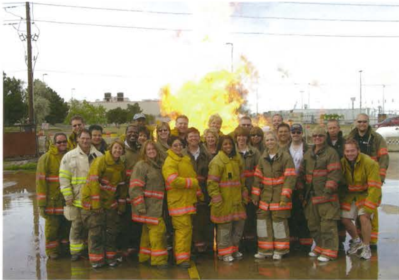
Leadership Aurora Class of 2006. We are SMOKIN' HOT!