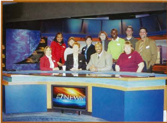
Not quite ready for 'prime-time' players

“It is great knowing the next generation of Aurora leaders are going to have the skills and background needed for future leadership, and it is being attained here in Aurora!”