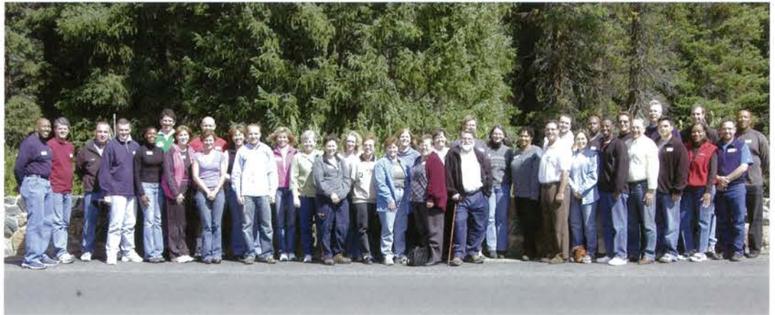
Leadership Aurora class of 2007

As the weekend began, 37 strangers began a journey seated around a large table at a beautiful resort in the Colorado mountains. Members of the Leadership Aurora board welcomed the participants and shared a little bit about where the weekend’s journey would take them, what experiences lie ahead for them during the upcoming year and participants spent a little time getting to know their