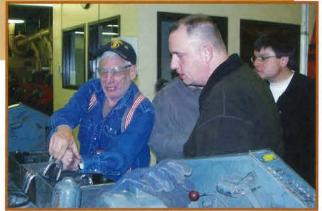
So, that's how they make horse shoes.

It was clear to all Leadership Aurora class members that the education system in Aurora, truly is a lifelong learning experience, and an impressive one at that!