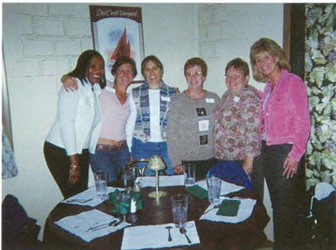
Enjoying a girl's night out

The retreat ended the morning of the third day. After listening to a panel of leaders from Aurora share their experiences and knowledge, the class elected its leadership for the upcoming year. And, as the first mountain snow for the season began to fall, the retreat ended. Many of the class shared that this was one of the best leadership and team building retreats they had ever attended.