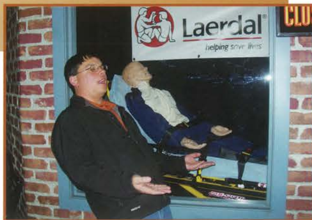
Which one's the dummy?

The final presentation was an overview of the new Children's Hospital with its impressive architecture and state of the art medical facilities. What a coup for the City of Aurora to get such an impressive hospital after being in its current location for nearly 100 years!