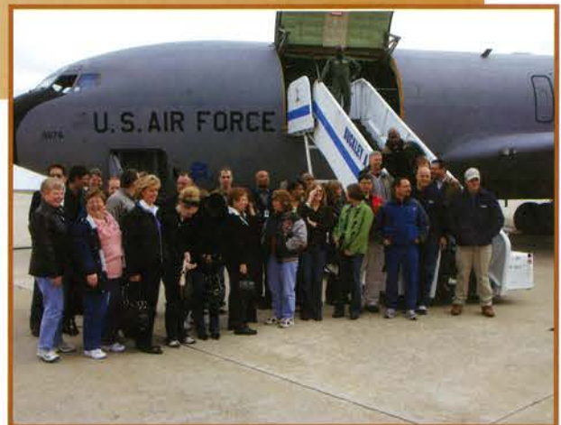
This is the flight to Cabo, right?

Certainly the highlight of the day was our flight on board a KC-135 Stratotanker out of Alaska. This huge tanker aircraft took us out to Eastern Colorado where we refueled two flights of COANG F-16s. Looking out from the tail of the KC-135 as the ‘boom operator’ refueled the fighters in flight was absolutely incredible. Our two hour adventure allowed us to see first hand the tremendous training and professionalism of our men and women in uniform. Our thanks go out to these neighbors who are such a vital part of our community.