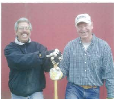
Gateway Women's Shelter Project