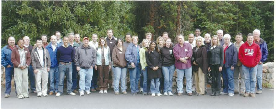
Leadership Aurora Class of 2009

Wow! We're going to have to tell all of these people we don't know what our greatest fear is and what is missing in our lives! This was the first test for each of us as a leader. This taught us how we attacked problems or how we avoided questions. They weren't joking around!