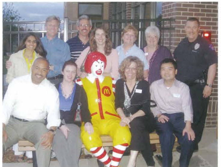
Ronald McDonald House