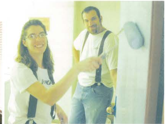
A facelift for Aurora Mental Health Center