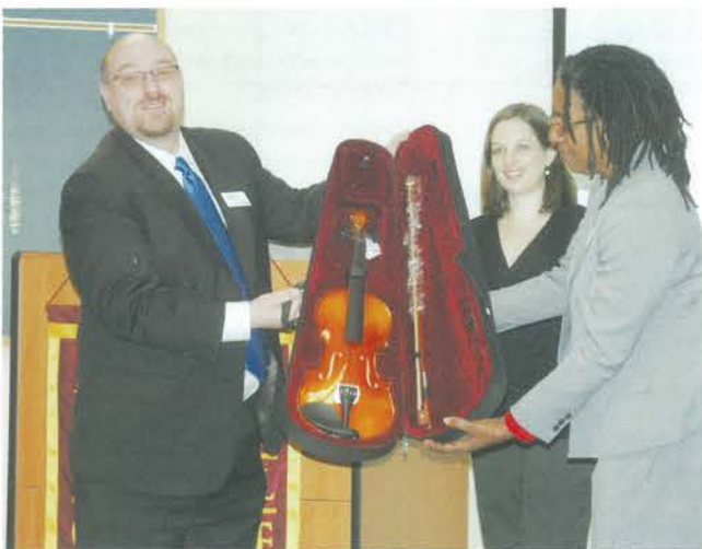
Fifteen violins donated was music to our ears.