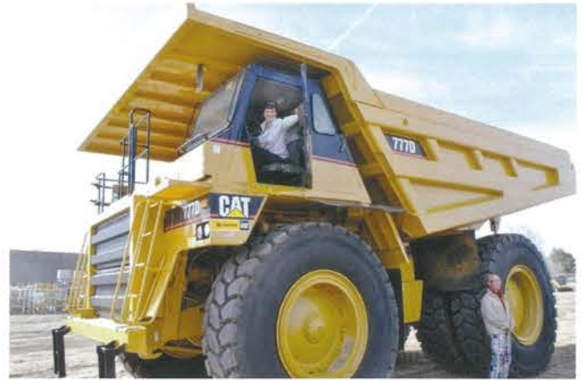
Our class knows how to have fun!

Finally, the afternoon was spent at Wagner CAT. We learned about the heavy equipment vendor and the scope of their business around the world and in the U.S.A. After an informative introduction, we went on a tour of their repair and parts facilities. We were also able to test-drive bulldozers, excavators, extra large dump trucks and bobcats. It was a bucket-load of fun!