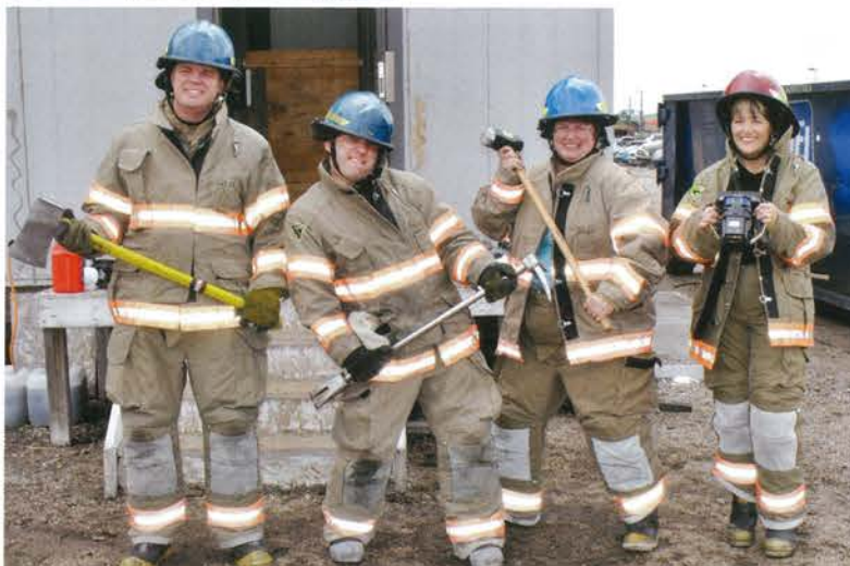
“Oh yeah – we’re hot!”