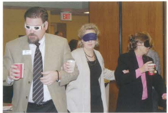
"See no evil, See no evil, See no evil" participation at the disability breakfast.

At the University of Colorado Hospital, we were briefed by the Burn unit, gowned up, and participated as a "burn patient" was admitted into the unit. The experience of seeing how quickly the unit has to respond to an extremely difficult situation was incredible: vital signs,