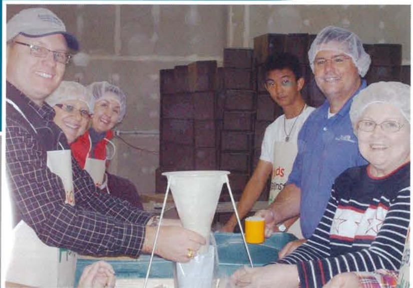
Volunteer assembly line filling up food bags.