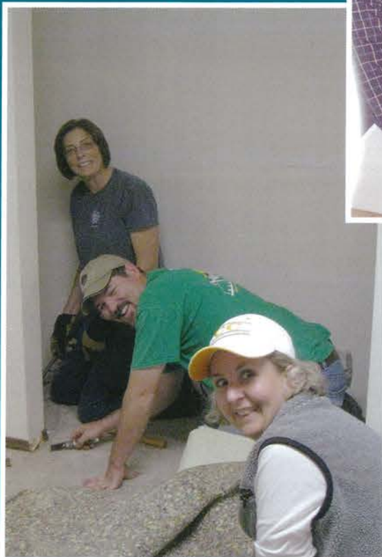
Pulling up carpet during Girls Hope home renovation.