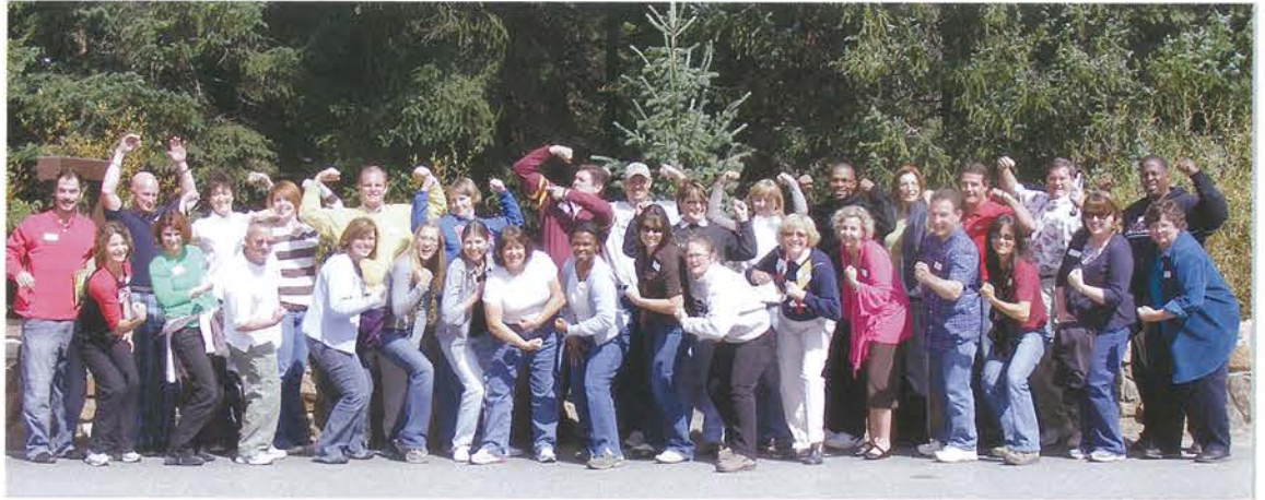
Leadership Aurora Class of 2010

The prospect of working together with this group for years to come already had its appeals to each of us – what could we do to make it work