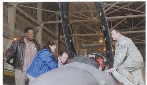
"Do bags fly free?"

As repair and upkeep is as important as actually flying the F-16, we took a tour of the F-16 hangar. We had dozens of questions answered about these awesome machines, and saw, firsthand, the limited room that the pilots have in the cockpit.