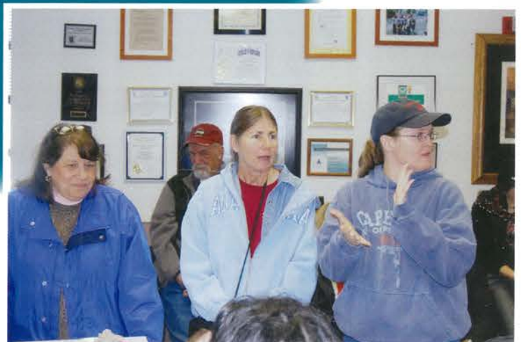
Holiday food basket delivery in conjunction with Leadership Board.