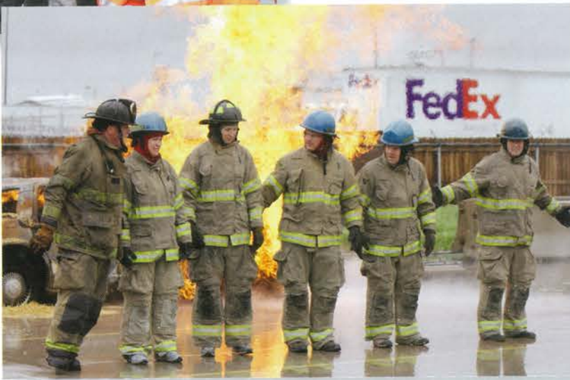
Burn, baby, burn!