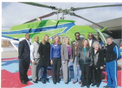
Class members and a Flight for Life helicopter

The session ended after a visit to the Lowry Campus of the Community College of Aurora, where we had lunch with the "Food Guy" and interactive presentations in Disaster Management, Solar Technology and Bio-Technology/DNA Isolation.