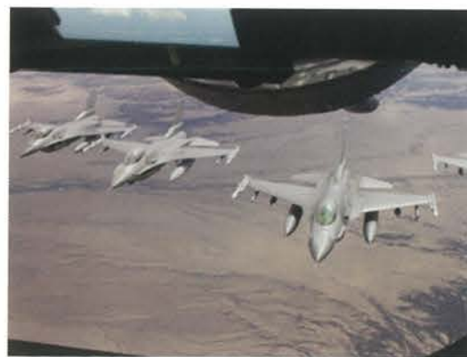
Colorado Air National Guard defending the skies

The highlight of the day was the flight in the KC135 cargo plane. The flight almost didn't happen due to high winds but thanks to the patience of the crew, we were able to fly. And that wait paid off with gorgeous Colorado skies and snow capped Rockies over which to fly. In the blink of an eye, six F-16 Fighting Falcons were flanking us. One by one, we lay down in the tail of the plane to observe a fighter pilot only 8 feet below refueling and waving hello. The afternoon ended with laughter among friends as we landed safely at Buckley and bounced with excitement.