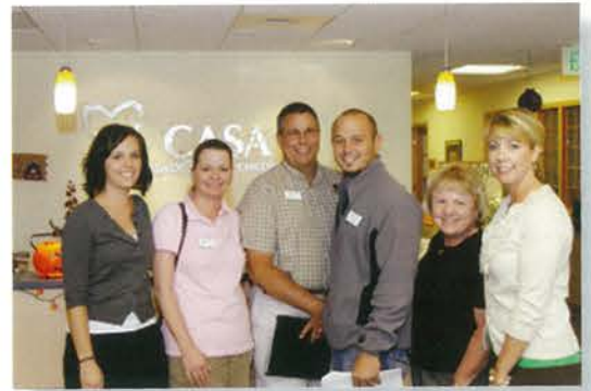
Visiting CASA during the Community Session

We also learned about some of the support services available to the poor and homeless in our community. We explored the Salvation Army, Aurora Interchurch Task Force, Friends of St. Andrews, Comitis Crisis Center, ARC, Aurora Housing Authority, and Metro Community Providers Network. These support organizations provide emergency food, clothing, shelter, transportation, and medical assistance to struggling Aurora families.