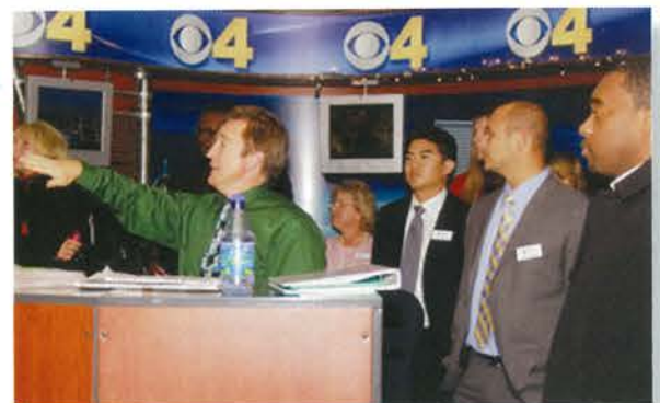
The class tours the CBS4 Studios.

The class then visited the television studio at CBS4 Denver, KCNC-TV. We were given a personal tour of the studios and the newsroom. It was very enlightening to see the "behind the scenes" effort that goes into daily news production. However, the highlight of the day was our visit to Aurora Channel 8, the television station for the City of Aurora. We learned about the different aspects of an in-studio television production; everything from what goes on in the control