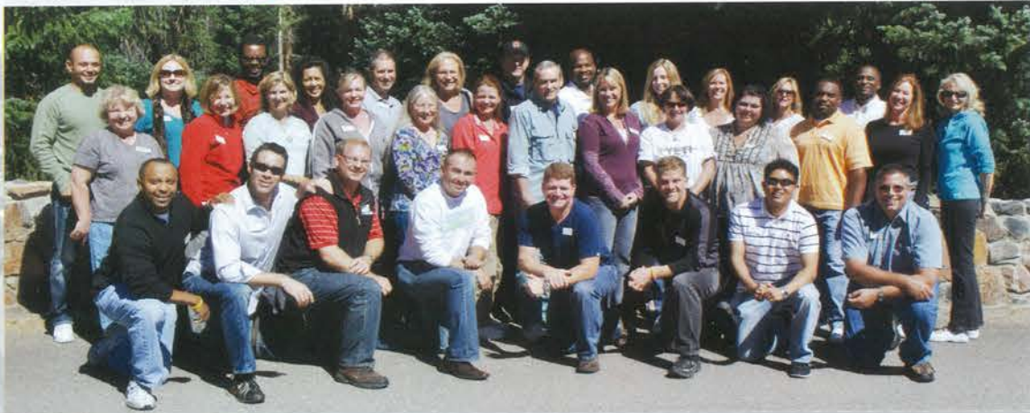
Leadership Aurora Class of 2011