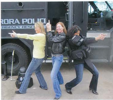
Leadership Aurora "Angels"

It was a humbling experience to see others give of themselves to serve those who are less fortunate. We are awe-inspired at how much these organizations do for those in need with so little funding. It is important for each of us to support these organizations to move Aurora forward.