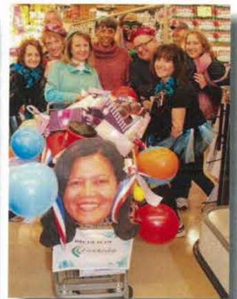
Comitis Grocery Cart Race