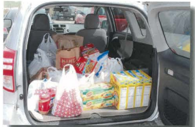
Food Bank Drive, Restoration Outreach Program

Last, our Legacy Project was a special opportunity to leave our indelible mark in the Aurora Community and we are grateful to have had the opportunity to partner with the Aurora Fox Arts Center. The AURORA Fox Studio Theater was originally built as a rehearsal space then converted for performances in 2008. With more than 100 performances a year, as well as hundreds of rehearsals and classes, the studio has become a key facility serving Aurora's cultural life. Our project included conceptual design services for a new main entry handicap access ramp and removal and rebuilding of the existing seating risers. While the facility is accessible, patrons in wheelchairs navigate through a labyrinth of non-public spaces just to get to their seat. The Fox's goal is to implement a new fully accessible main entrance that complies with the Americans with Disabilities Act. The conceptual design