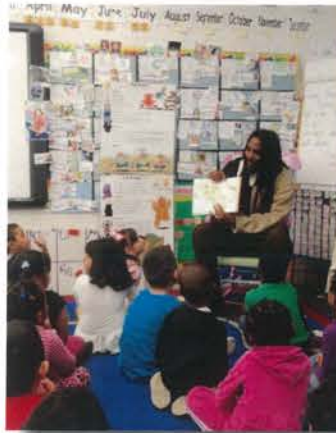
Leaders are Readers