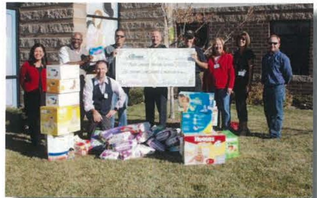
MCPN Diaper Drive