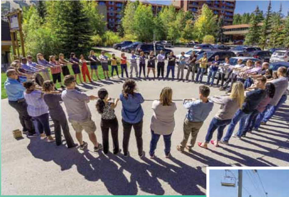
Getting to know each other and learning how to work together to complete the task at hand.

Feeling honored to be part of the Leadership Aurora class of 2019, and yet not knowing anyone, or what to expect of the weekend - most of us made the trip up to Breckenridge with anxious thoughts. It was amazing how much knowledge and how many team building activities were squeezed into two days.