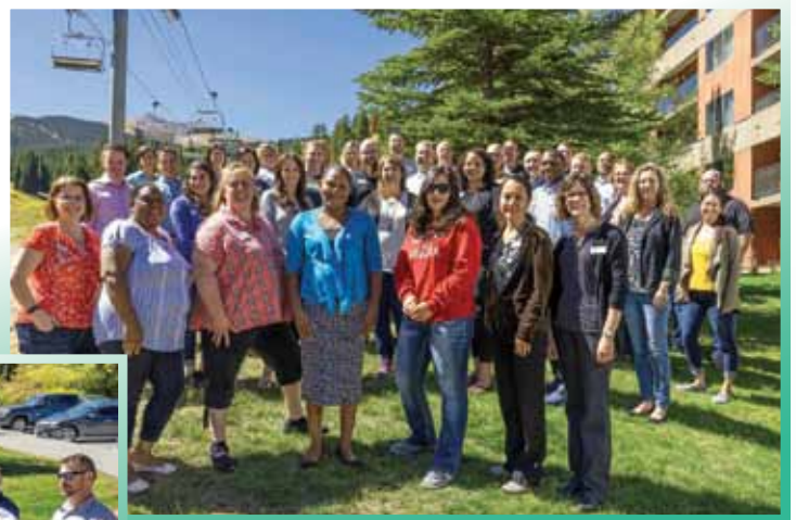
Incredible classmates in beautiful surroundings — ready to share an awesome year together!

The trip back home came too quickly, but we were all feeling encouraged in knowing that the best was yet to come and new friendships were already forming.