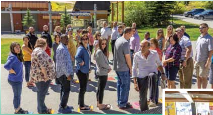
The group exercises showed us that we can accomplish anything... together.