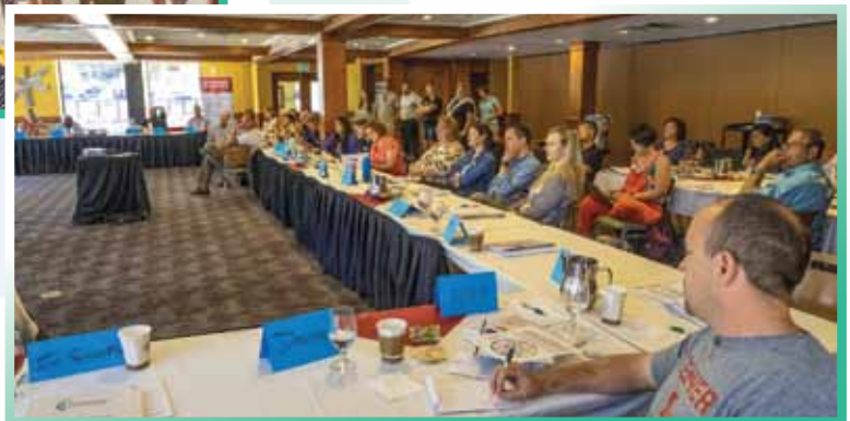
Sometimes, 'classrooms' can be a bit boring... but not this one!