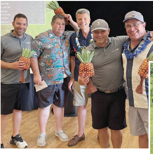
Best Hawaiian theme-dressed team went to the Advantage Security, Inc. men's team. And you can see why.