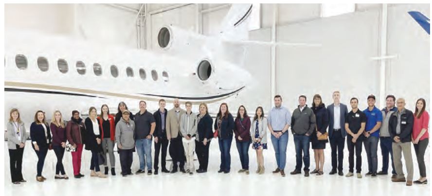
YPs at Centennial Airport