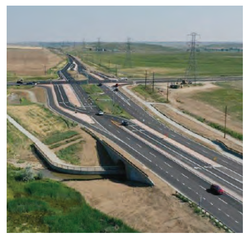
Widening of Gun Club Road south of Quincy

Arapahoe County has been, and will continue to be, busy and actively working with DRCOG and other local agencies to update various Transportation Improvement Plans (TIPs) detailing identified uses for those funds. The County draws projects from their