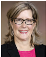
Commissioner Carrie Warren-Gully