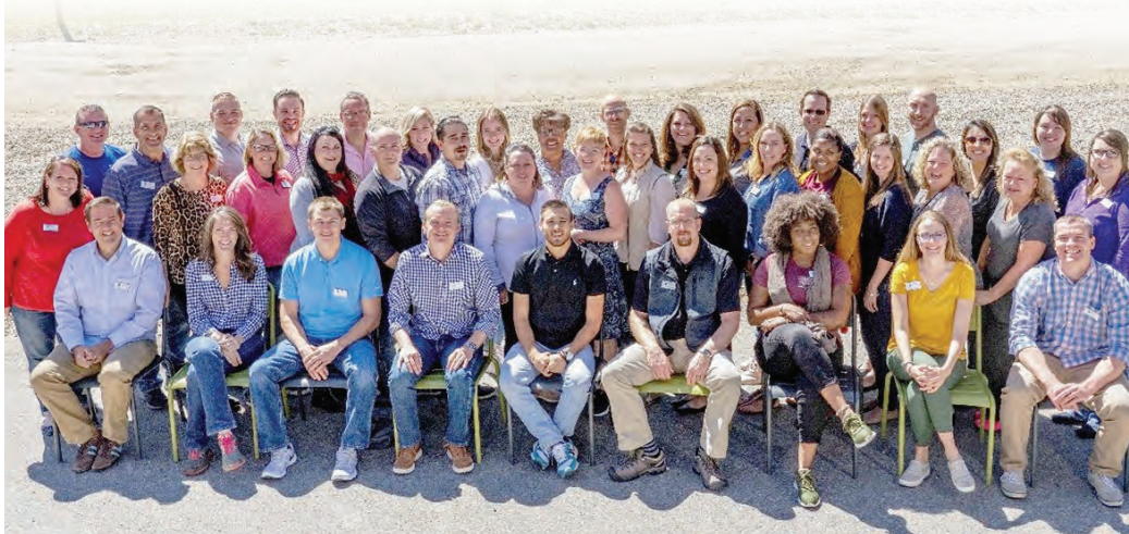
Leadership Aurora Class of 2020 at their Retreat in September 2019.

*A double designation that we sincerely hope no class ever challenges!