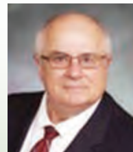
Rep. Rod Bockenfeld