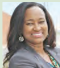
Rep. Naquetta Ricks