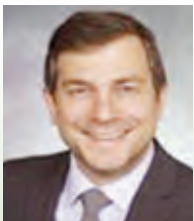
Sen. Jeff Bridges