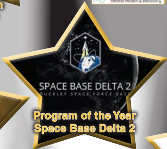
Program of the Year Space Base Delta 2