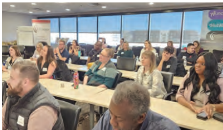
It was a full house at the February 2023 Young Professionals' CEO Panel.

advice for the YP's. The session started with 30 minutes of networking over coffee and cookies, followed by introductions, and transitioned into 1.5 hours of flowing conversation and engaging questions.