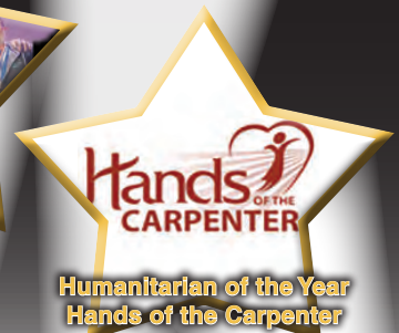
Humanitarian of the Year Hands of the Carpenter