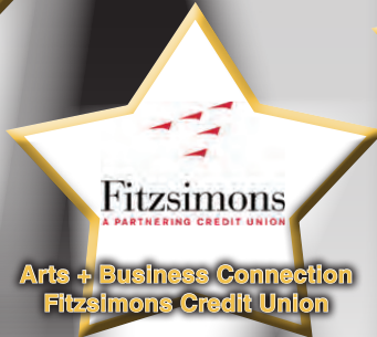
Arts + Business Connection Fitzsimons Credit Union