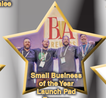
Small Business of the Year Launch Pad Brewery