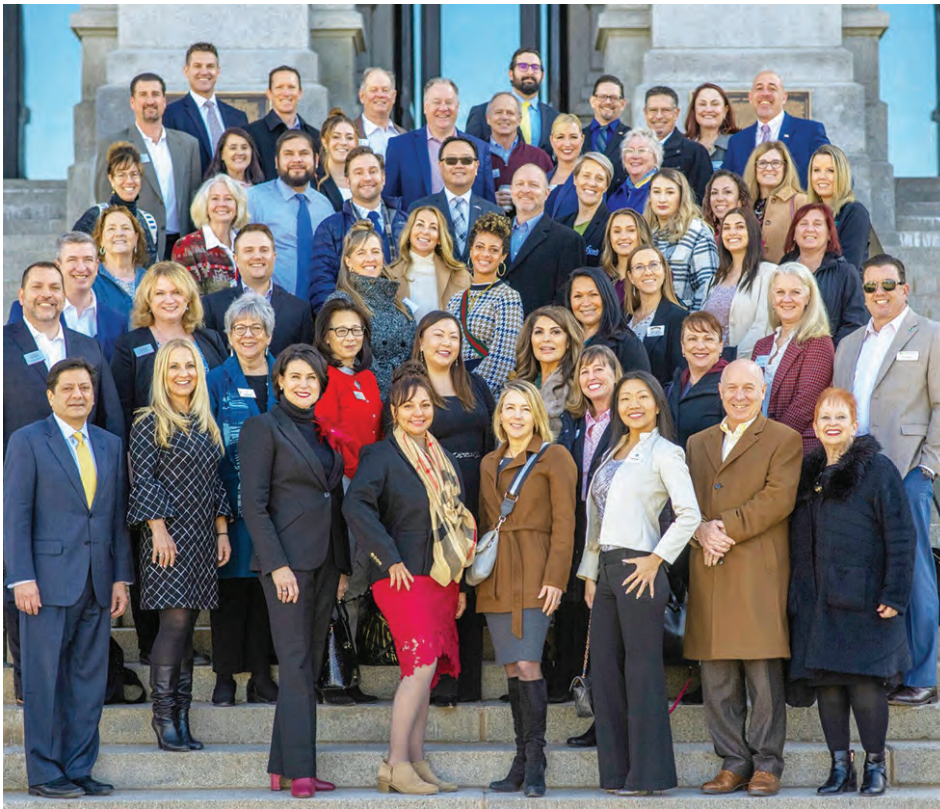
Chamber members gather for Chamber Day at the Capitol.