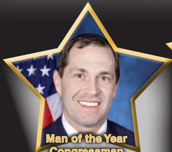
Man of the Year Congressman Jason Crow

The Aurora Chamber of Commerce proudly announces the recipients of the 2022 Awards, which will be presented at the Friday, April 7, 2023 Red Carpet Awards Banquet at the Hyatt Regency Aurora-Denver Conference Center, 5-10 pm.