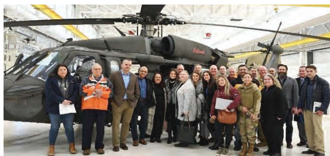
Defense Council Members enjoy a tour of the AASF.