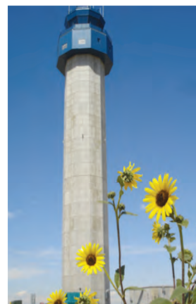
CASP boasts the Tallest General Aviation Air Traffic Control Tower in North America (191 Feet).

Kloska began by giving an overview of the CASP facility, which includes a combination of airport and future spaceport operations. The 24-hour traditional air operations with more than 50 hangar facilities and 300 based aircraft continues to grow each year and the facility is well-positioned for long-term growth.