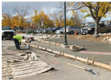
Work being done on the 25th Ave. pedestrian corridor.

Campuzano showed technology improvements for traffic signals and progress on the Fiber Optic Master Plan. Two projects on Havana Street, one at 6th Ave. and one including 11th Ave. and Del Mar Parkway, will improve traffic flow and increase safety.