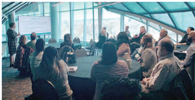
Art + Science at the Denver Museum of Nature and Science.

CASP recently completed a Spaceport Master Plan