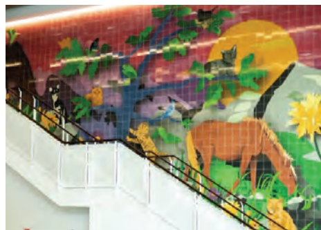
Curated art at CSU Spur.