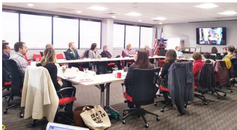
It was a full house for the January Arts + Economic Development meeting.