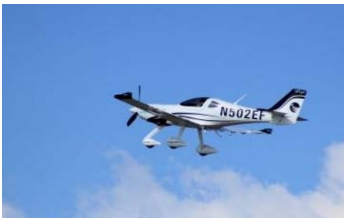
Bye Aerospace's eFlyer in flight

pilot training partner pursuant to a comprehensive agreement. The Quantum-branded pilot training program at OSM Aviation Academy will refer a steady supply of pilots trained to FAA commercial standards.