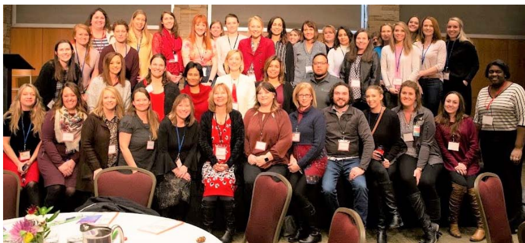
Work Well Coalition members at the February 13 American Heart Association Workplace Health Symposium.

In place of the February Health Series meeting, members were invited to attend Rewriting the Script: Wellness to Wellbeing, the American Heart Association’s Feb. 13 Workplace Health Symposium. Topics included Maximize the Mental Wellbeing of