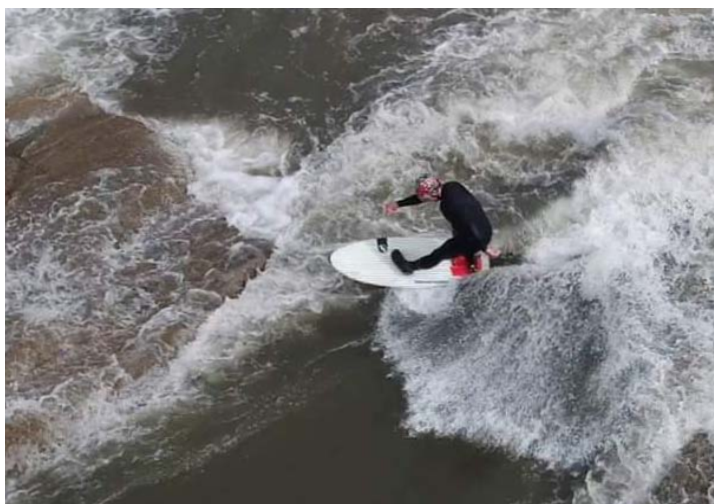
River Run Park in Sheridan, CO.

has the capacity to support a signature high-performance surf wave amenity for whitewater enthusiasts. Developing the design involved detailing hydraulic modeling, bank stabilization measures, and integration of river structures to sustain the active waterway without promoting erosion or compromising safety.