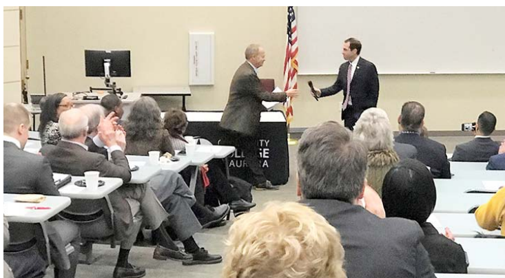
Congressman Jason Crow spoke to members of The Chamber's Government Affairs Committee at the Legislators Breakfast.