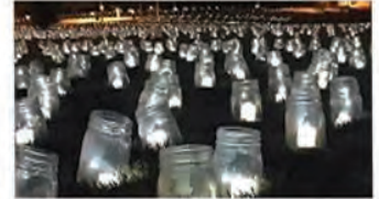
NOVEMBER 11-13 • 5-8PM Light Their Way Home Display of 6218 Luminaria's, one for each of our fallen

For full event details, how to get involved and more go to: ColoradoFreedomMemorial.com