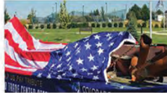
SEPTEMBER 11 TH • 12PM Patriots Day 20th Anniversary of 9-11 Static Displays and tributes