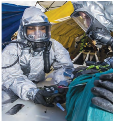
8th CST Member utilizing detection equipment.

in March 2020 to assist with significant COVID testing across Colorado.