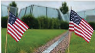
MAY 29-31 Memorial Day Weekend Self-Guided Tours, Flag Display