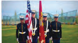
MAY 29 TH • 10AM Colorado Remembers on Colorado Day Annual Remembrance Ceremony