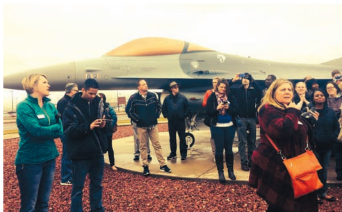
On a chilly March morning, the Leadership Aurora class of 2015 spent the day at Buckley AFB.