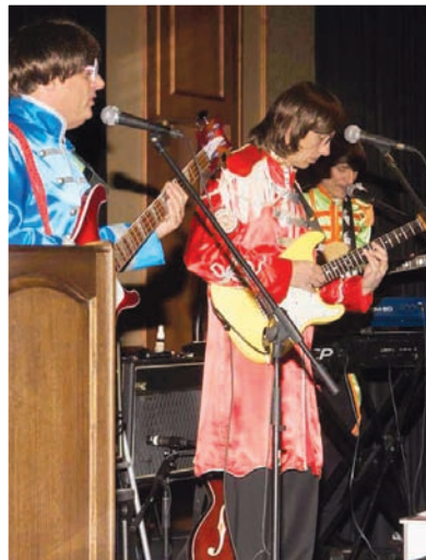
FourEver Fab — the "ultimate Beatles band" — rocked the house at the end of the evening

Special thanks to the evening's title sponsor, ConocoPhillips — as well as all of the generous sponsors: Pinnacle Assurance; Colorado Technical University; FirstBank; Wells Fargo Bank; Westerra Credit Union; University of Colorado Health; Fairmount Cemetery, Mortuary, and Crematory; Suss Buick GMC; CORT Furniture Rentals; and Great Western Printing, Inc. ■