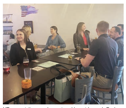
YPs spent the evening networking at Launch Pad Brewery in Aurora.

On August 18, 2021, the YPs spent the evening networking at Launch Pad Brewery in Aurora. There were about 25 at the event, and everyone enjoyed beer and the company of other business professionals. It was an evening to get the YPs together again for the first time since the Pandemic began. We look forward to being in-person again more often!