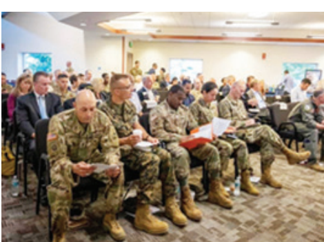
Defense Council at 140th Wing, Colorado National Guard

in an austere environment with limited basing, while testing their abilities to quickly and efficiently land, set-up operations, fly, pack, and transport themselves at a moment's notice.