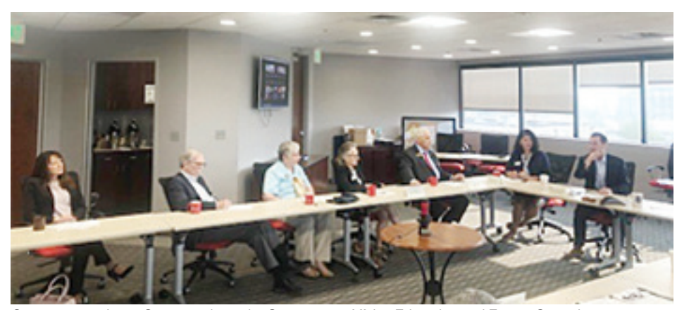
Congressman Jason Crow speaks to the Government Affairs, Education and Energy Committee