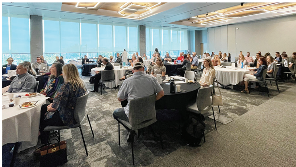
The June 8 Recovery Friendly Workplace Initiative event was well attended, including business leaders, employers and employees, and healthcare professionals.

trauma – and emphasized that work is a key factor for individual recovery. Panel members concurred that employers should be open to conversations about substance use and mental health, and that the opposite of addiction is not sobriety, rather, it is connection.