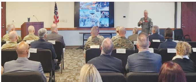
Col. Tucker provides the 140th Wing mission briefing to Defense Council members at the 140th Wing, Colorado Air National Guard.

The Wing also operates two space missions; a one-of-a-kind early-warning Mobile Ground System, located at Greeley Air National Guard Station in Greeley, CO, and a space control squadron and training detachment at Peterson Air Force Base in Colorado Springs, CO. Colonel Tucker also expressed the importance of finding a replacement for the aging F-16 fleet.