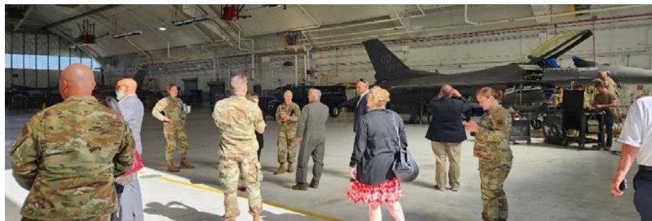
Defense Council members get up close to an F-16.