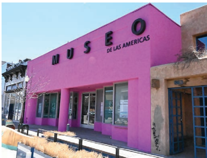
Museo de Las Americas, 861 Santa Fe Dr, Denver, CO, 80204