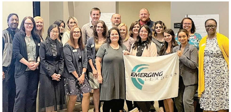
The inaugural class of The Chamber's Emerging Leaders.

To see upcoming Chamber meetings as well as Chamber member events – go to the calendar!