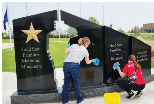
Carefully cleaning the Gold Star Families Memorial Monument.

The Colorado Freedom Memorial, at 756 Telluride St. in Aurora is a peaceful place to reflect and remember those who have given their life for our freedom.