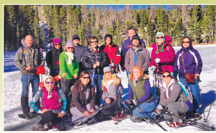
The Young Professionals' January 2014 social event - skiing - brought together a colorful crowd in Estes Park. In March, they're 'freezin for a reason' at the Special Olympics Polar Plunge at the Aurora Reservoir.