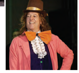
Willy Wonka encouraged attendees to taste everthing!

Everyone has a golden ticket! — The newly-renovated Embassy Suites Hotel Denver Stapleton pulled out all the stops for the February 27 Ribbon Cutting/Business After Hours. With the fun and festive theme of Willy Wonka and the Chocolate Factory, there were plenty of 'goodies,' including a live band, lots of sweet treats, a photo booth, Oompa Loompas, and Willy Wonka himself! Mark your calendar for the March 27 joint Business After Hours with the Asian Chamber at the Red Lion/Radisson Hotel.