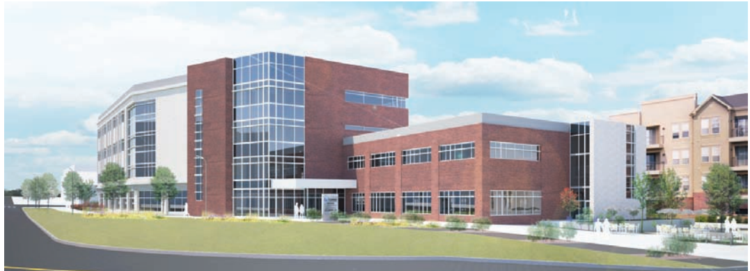
Rendering of Bioscience 2

A new venture next to the Anschutz Medical Campus combines research, business and education - all under one roof.