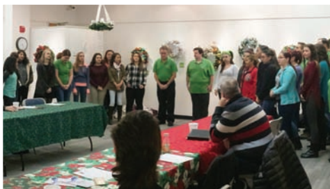
Aurora Singers and Rangeview Rhapsody entertain at the Holiday Gathering of Business for the Arts.

Holiday Cheer (12/6/16) – Early morning performances of the Rangeview Rhapsody and