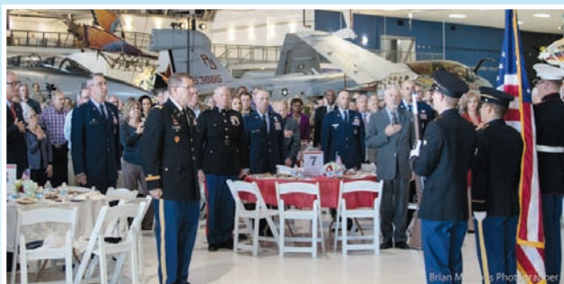
The Aerospace Data Facility Colorado Joint Color Guard presenting the colors during the National Anthem at the Aurora Veterans Salute.

While I sat in the Hanger of the Wings over the Rockies Air and Space Museum for the Aurora Veterans Salute, the MC announced for all Vietnam Veterans to come to the front to get a token of gratitude. I watched all the "old-timers" walk to the front with their decorated War Ball Caps and Vests and I noticed something