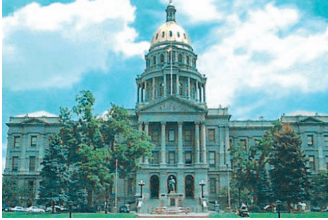
Colorado State Capitol