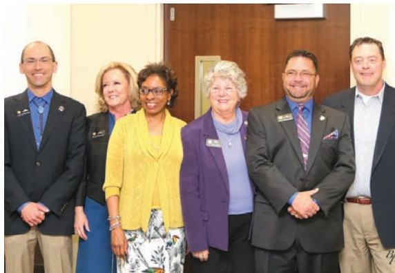
The annual Mid-Term Legislative Breakfast was held April 2 at the Medical Center of Aurora (TMCA) - South Campus. Legislators in attendance, left to right: HD 36 Rep. Mike Weissman, HD 39 Rep. Polly Lawrence, SD 29 Sen. Rhonda Fields, SD 28 Sen. Nancy Todd, HD 56 Rep. Phillip Covarrubias, and SD 27 Sen. Jack Tate. TMCA generously provided a hearty breakfast for the group of nearly 70 attendees.