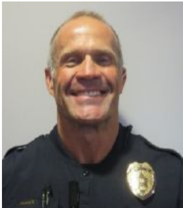
Pay it Forward Committee Chair

I have been with the Aurora Police Department for almost 20 years. I have served various roles including; field training officer, SWAT operator, Street Crimes unit (DART), and PAR Sergeant. I'm currently a Sector Lieutenant at the District 3 Station in Tallyn's Reach and Emergency Response Team Commander. I oversee the districts community resource officers as well as lead and direct our crowd control unit.