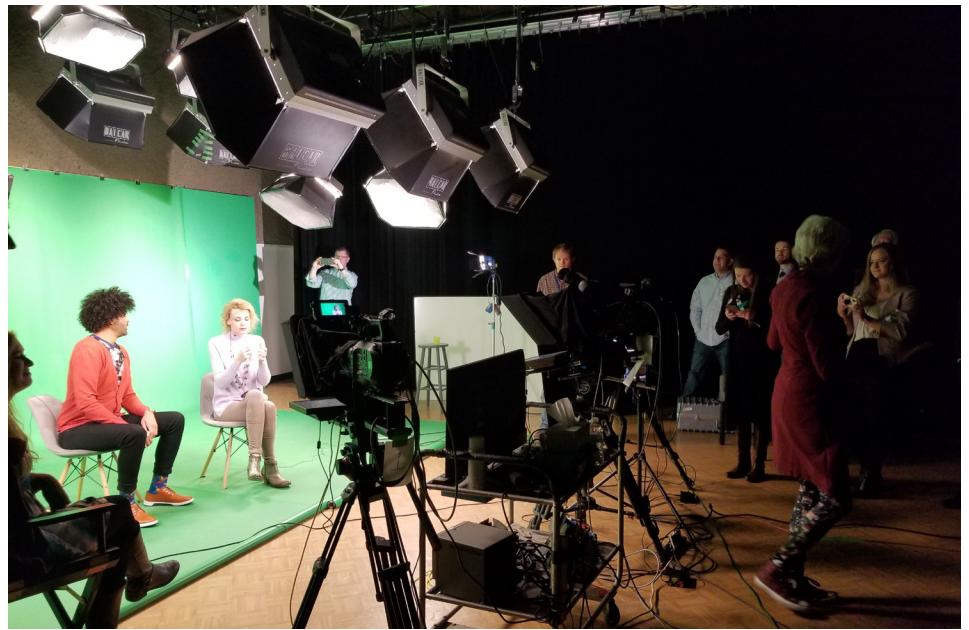
Class members tour the Rocky Mountain PBS studios.

Leadership Aurora headed down to the dark underground of Channel 6 where we were surprised to find machines and equipment behind glass like a museum. We were equally