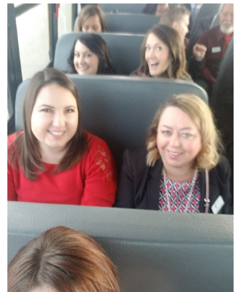
Class members take a bus from the Aurora Municipal Center to the Rocky Mountain PBS studios.

Overall, the day was informative and insightful.