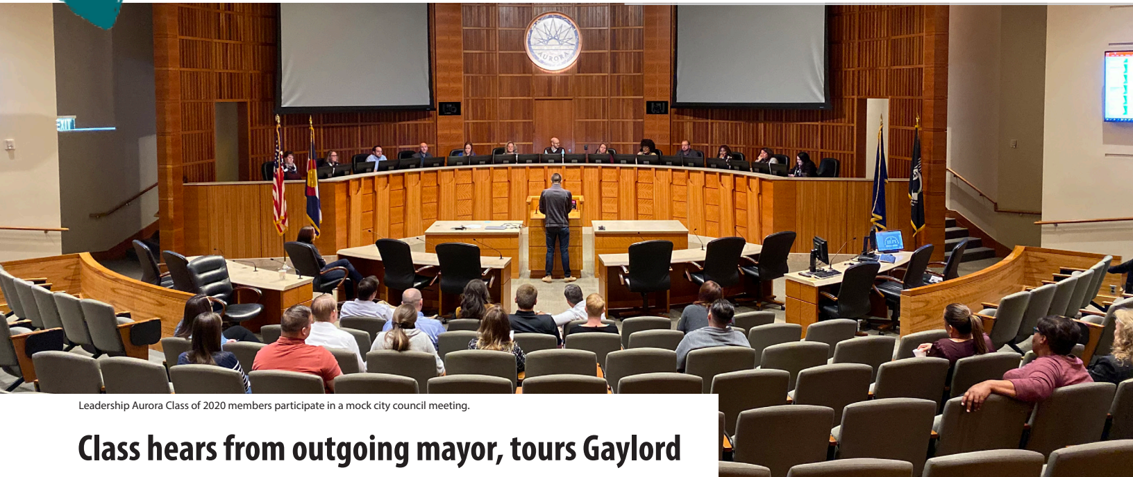
Leadership Aurora Class of 2020 members participate in a mock city council meeting.